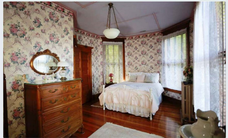
Duchess Kate Room

Special Valentine's dinner reservation The Red Geranium or MaryScott's Kitchen 25% off gourmet cooking class Capers Emporium, Feb. 16, 11am-1:30 pm