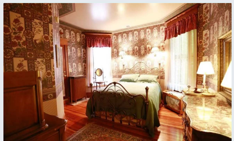
Prince Harry Room

Special Valentine's dinner reservation The Red Geranium or MaryScott's Kitchen