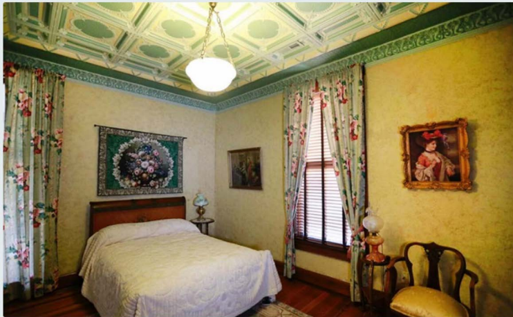
Princess Diana Room